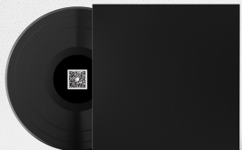
Leave-Behind Case Back with QR code to my website