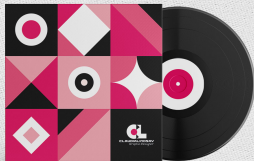
Leave-Behind Case Front