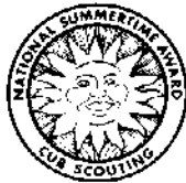
National Summertime Award pin for boys who attend all three summertime pack activities, No. 00464