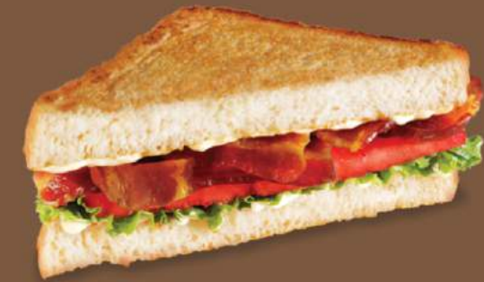
BLT (Bacon, Lettuce, Tomato)