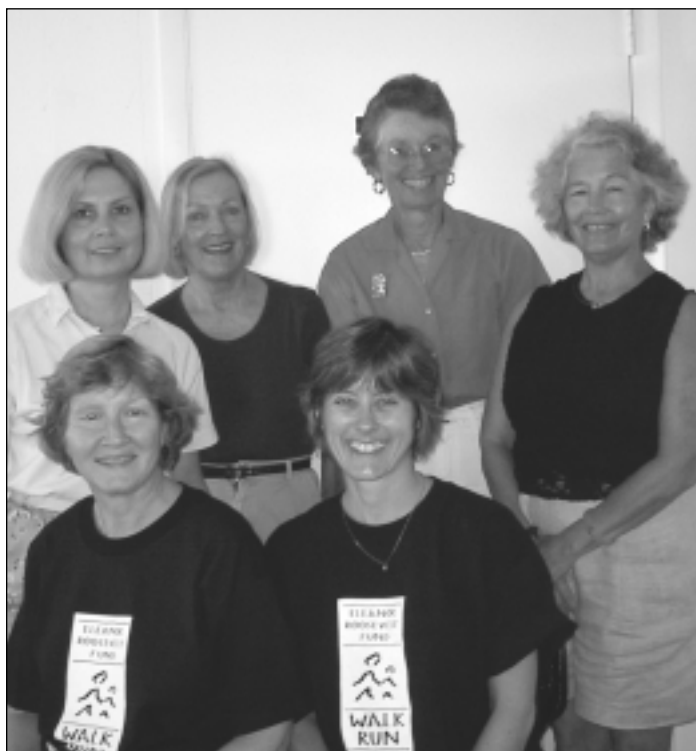
Part of the Planning Committee for the Walk/Run to be held at Palm Beach Community College.