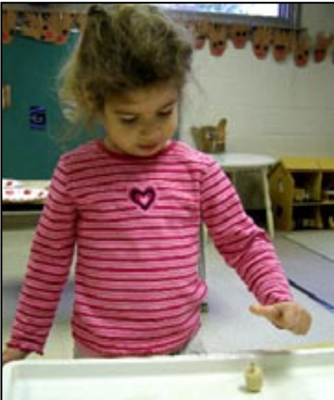
Fine motor, Social Studies (celebrations)

Have you spun a dreidel lately? When preschoolers play there's no exchange of candies or pennies. We spin just for the joy of spinning! Like any skill, it includes some trial and error, but once mastered, your small hands do have quite a bit of power in them.