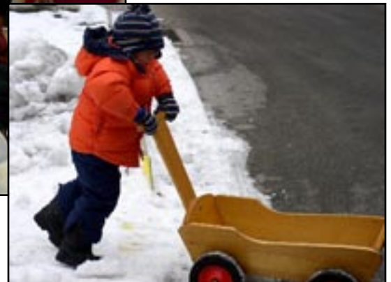
Above: A picture from the PS Jingle Bell Celebration December 2005 At right: Look at what we had on our playground last December 15!