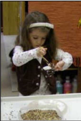
Naturalist (pinecone, seeds, birds), Tactile