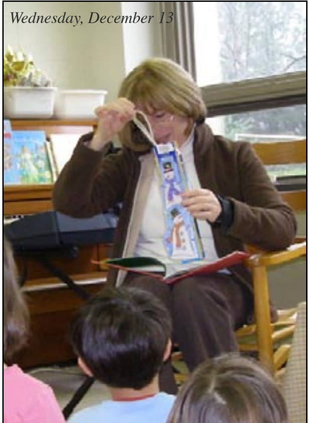
Wednesday, December 13

Do you remember your first View Master? Preschool has three in the classroom. The slide collection includes several Discovery slides of animals in the wild. If you know of any sources where we can find more quality slides let us know; we are always hoping to add to our collection.