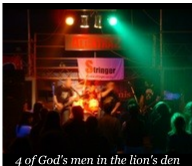
4 of God's men in the lion's den

On the last Saturday of March, a local music club hosted the second „open“ phase of a band competition, and our band was able to sign up and play. This was a long-awaited open door to do public ministry, as so far, the band's outreach is to the various teens and young adults who show up for the weekly practices held at the church. There were some technical issues and the crowd wasn't too keen on hearing any messages between the four songs played, but nevertheless, it was a good experience. To the disappointment of a few friends, we didn't win that night, but that wasn't our purpose in playing. We were there to glorify the LORD and be among the