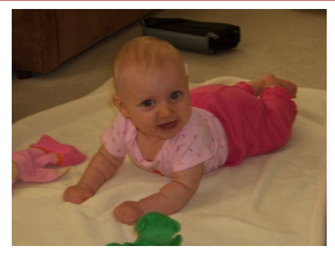
Getting stronger... (September)