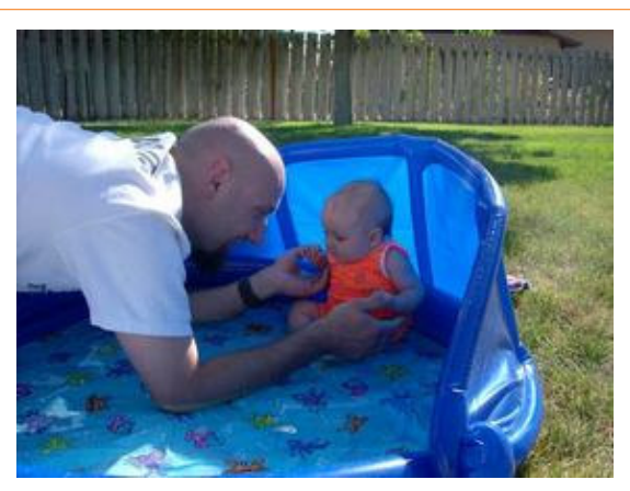
First" swim" (3 months, August)