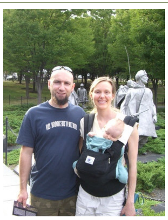
At the Korean War Memorial in Washington, D.C.

Our hearts were greatly refreshed and encouraged by our 10-day trip! The brothers and sisters there welcomed us like family, and we