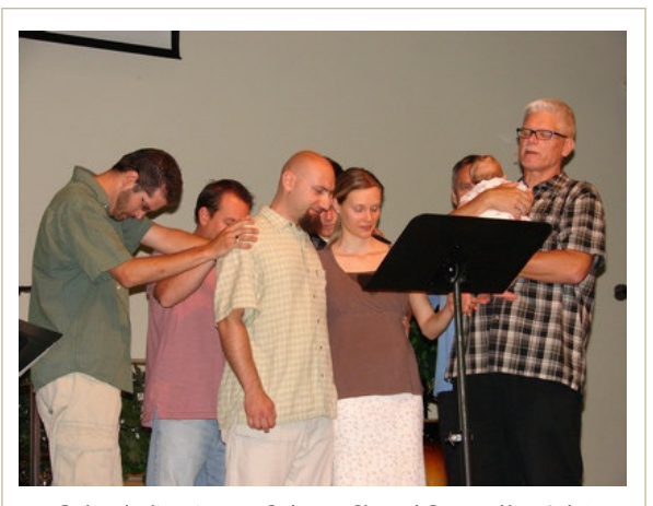
Baby dedication at Calvary Chapel Pocatello (July)