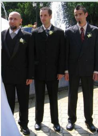
Band members band at our wedding

Since I went to Bible College, the hardcore band I'm in hasn't had much ability to get together and work. We had a few practices during these last three years, and in spite of that, the Lord kept the desire in our hearts to continue the band. We are now meeting for prayer and practice—sometimes also a Bible study—at least once a week. And the Lord has answered our prayers for somebody who could do vocals. We want to be ready for whatever doors open for us to reach the youth here with the truth of God and His love.