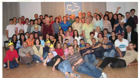
Most of the church from Calvary Chapel Subotica