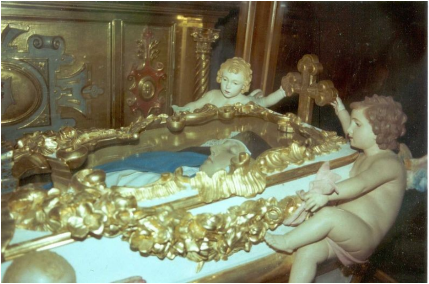
Incorrupt body of Mary of Agreda, in Agreda, Spain