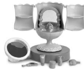
Ice Cream Sundae Vanity