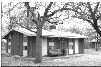
One of the cabins

LODGING is in bunkhouse cabins (with heat and A/C), with four bunk beds and two single beds in each of the two rooms flanking the bath. An attempt will be made to limit each side of the cabin to 5-6 persons, or a max of approx 12 per cabin. Tent and limited RV space is also available. See bottom of flyer for a list of alternative lodgings, i.e. nearby motels.