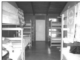
View inside a cabin