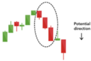
THREE BLACK CROWS