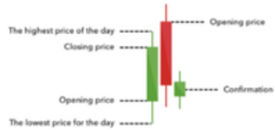
DARK CLOUD COVER