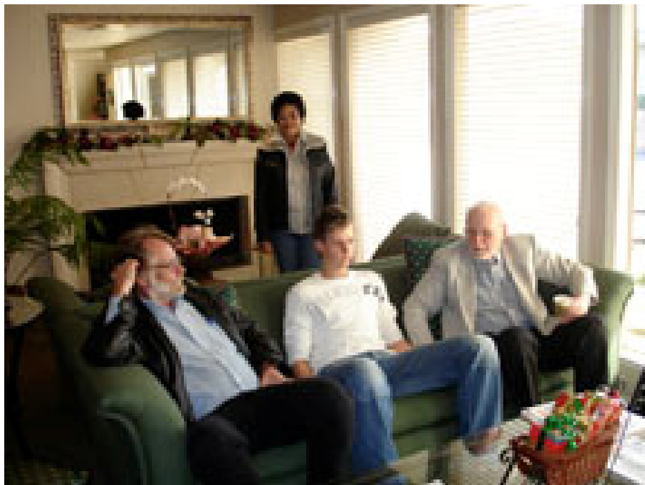
Lounging in the Lobby