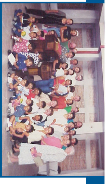
Operation Honduras Volunteers, February, 2003

money to making a difference in the life a child! who has contributed to OH and donated their time and accomplish its goals. Special thanks goes out to everyone our sponsors, members of OH would not be able to Without consistent support and monetary donations from