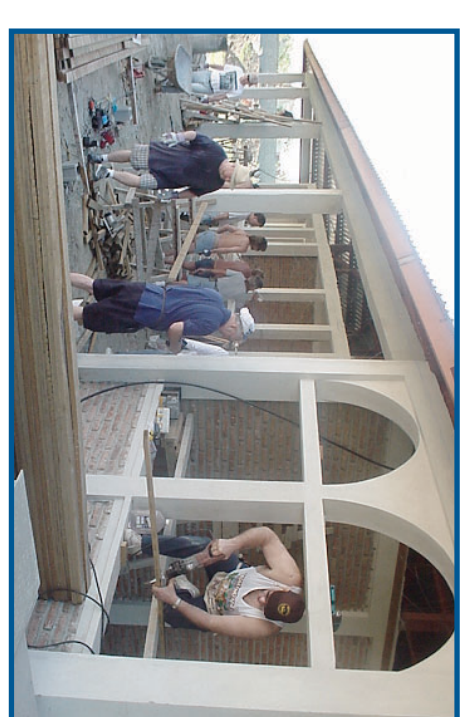
Operation Honduras Volunteers, February, 2003

St. Mary's St. Joseph's Church Rotary Church of Christ Uniting Westminster Presbyterian Church