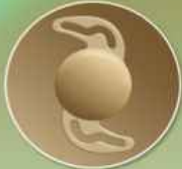
Model: CENTER FIX