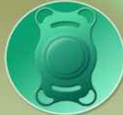
Model: ULTRA SMART