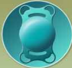
Model: CENTER FIT