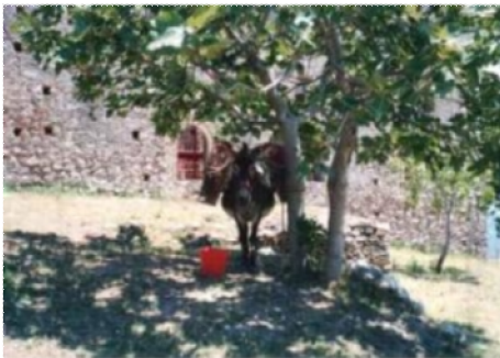
Figs. 9-10: Uses of donkeys in Greece in the past and today starting from the top left corner: transportation of people, as pack animal in small agricultural holdings and for transportation of building material to archaeological sites.

Donkeys use and management reflects the culture and activities that are characteristic of a given geographical region. Regardless of type of donkey use there are four different aspects that can be distinguished in each category: