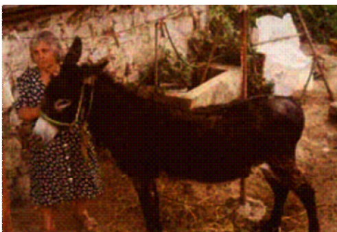
Figs. 1-6: Examples of the large variability of phenotypic characteristics amongst donkeys in Greece.

One of the most distinctive breeds of donkeys encountered in Greece is the Arcadian donkey. The Arcadian donkey originates from Arcadia region in Peloponissos. It is one of the most important indigenous donkey breeds. The aforementioned practice of using foreign jacks in breeding practices together with the decline in donkey population has resulted in the survival of a very small number of animals that share common characteristics and could be considered as a true breed. It is medium in size with body height ranging from 95 cm up to 120 cm and body weight from 90kg up to 120 kg. In Arcadia and Peloponissos in general there has been a tradition of keeping donkeys. Even today Arcadia prefecture hosts the largest number of donkeys (3,118 animals), whereas in the whole of Peloponissos there are 8,688 donkeys (about 42.4% of total population in Greece).