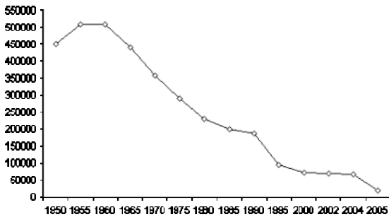
Table 2: Representation of donkey ownership

Methods for keeping donkeys vary depending on the type of ownership. Most owners have just one donkey to cover transport needs of goods and themselves and in general those animals are in good condition. Owners that are involved in agrotourism enterprises in mainland Greece as well as those in islands usually keep more donkeys to accommodate the needs of tourists transport. Our knowledge of how these animals are kept and managed is very limited. Hardly any research has been done about the latter aspects in Greece, but in general there is a dearth of available data worldwide (Kaushik, 1999). This lack of information sometimes makes it very difficult to get an appropriate view of donkey status.