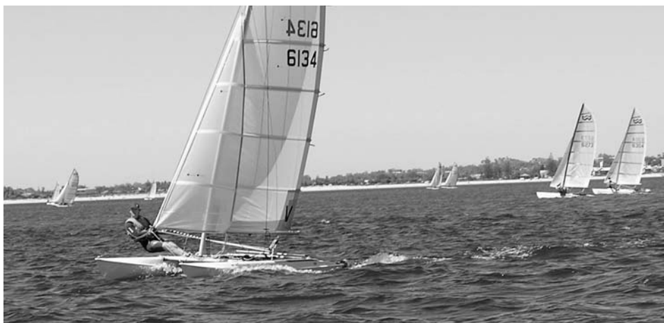
Peter Flemming - Victoria sailing Mr Bigglesworth

The invitation race got under way with most of us sailing sloop or cat and with four super sloops making up the fleet, off we sailed in a moderate sea breeze. Brett Bassett had XTC wound up and was 1st home by a couple of minutes, but had to wait until presentation night to see if he had done enough to win