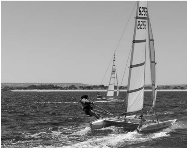
Jaws supersloop in a strong easterly breeze, typical of the regatta

I'm sure all that attended the 2004 Nationals, will agree that Bunbury was an excellent venue. From the hospitality of the yacht club members, to the great take away food shops that were within walking distance of the club, which were frequented on nights when there was no meal at the club.