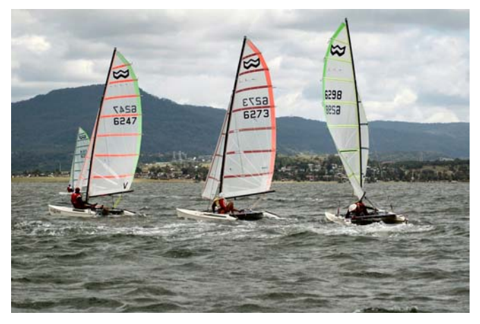
Some wild jibing at the 2005 nationals