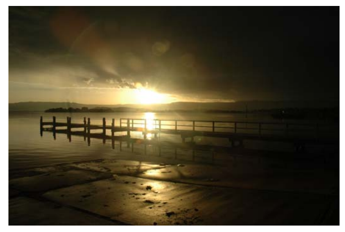
Sunset over the sailing venue