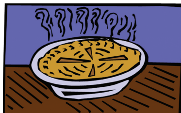
Pic.2.4 (Clipart 2003)

Below are the steps to make instant fried noodle. They are not in the right order. Put them in the right order and use necessary words of sequences.