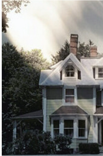
Pic. 7.2 (Clipart, 2005)