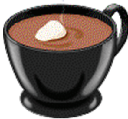
Pic. 7.1 (Clipart, 2005)