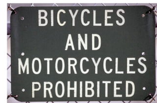
Pic. 7.4 ( http://www.google.signs )