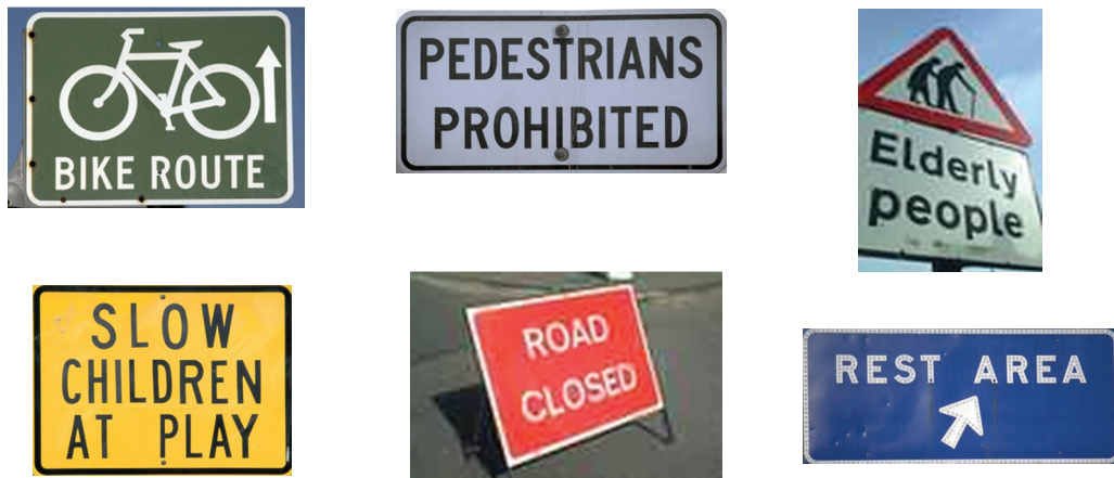
Pic. 7.5 ( http://www.google.signs )